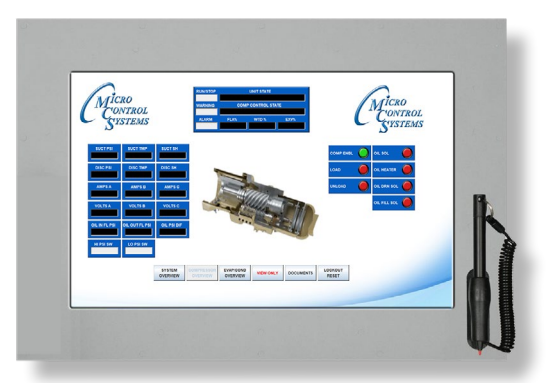
COMPRESSOR OVERVIEW SCREEN