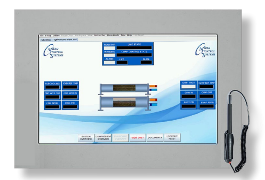
EVAPORATOR CONDENSER OVERVIEW SCREEN