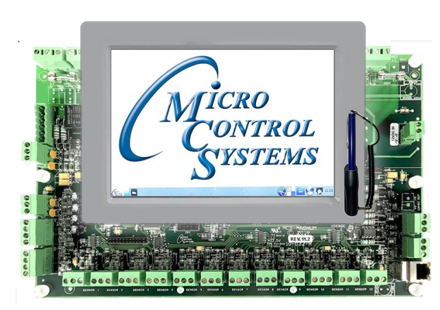
Part # MCS-MAGNUM-15.4-12